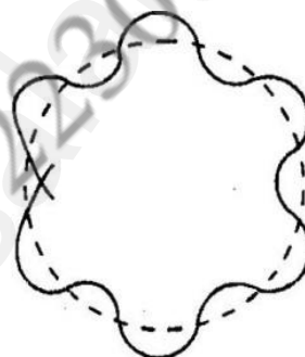
(b) Wave not in phase

The wave trains of an electron moving in a circular path around a nucleus