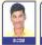
B.COM TAMIL NADU STATE