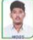
M. NARAYAN GOVT SCHOOL TOLLER, TOLLER