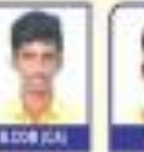
B.COM TAMIL NADU STATE