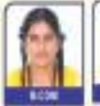
B.COM TAMIL NADU STATE