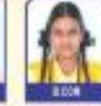
B.COM TAMIL NADU STATE