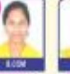
B.COM TAMIL NADU STATE