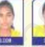
B.COM TAMIL NADU STATE