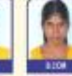
B.COM TAMIL NADU STATE