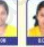
B.COM TAMIL NADU STATE