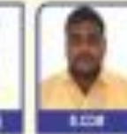
B.COM TAMIL NADU STATE