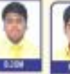
B.COM TAMIL NADU STATE