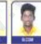
B.COM TAMIL NADU STATE