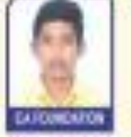
CA FOUNDATION TAMIL NADU STATE