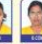
B.COM TAMIL NADU STATE