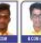
B.COM TAMIL NADU STATE