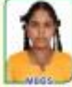
K. SUNDARDEVI GOVT SCHOOL TOLLER, TOLLER