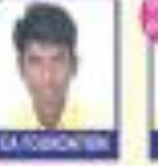
CA FOUNDATION TAMIL NADU STATE