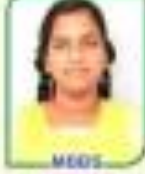
VARSHA S GOVT SCHOOL TOLLER, TOLLER