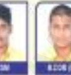
B.COM TAMIL NADU STATE