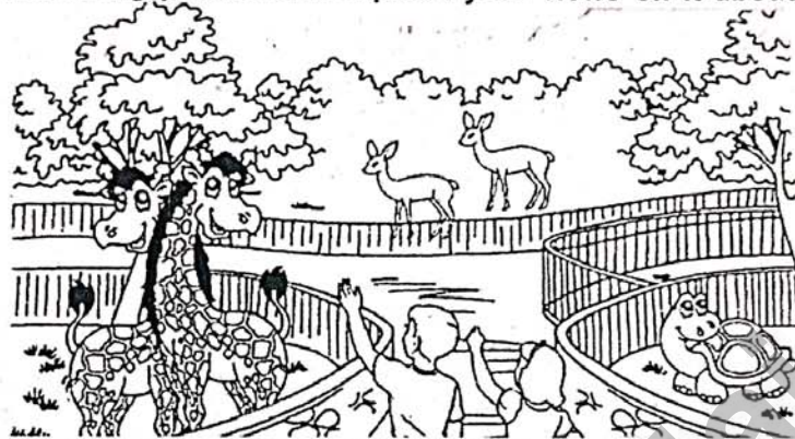
SECTION - V