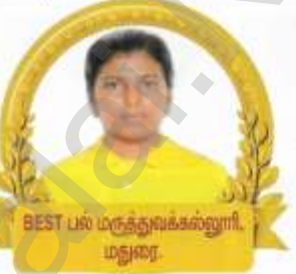
BEST பஸ் மருத்துவக்கல்லூரி, மதுரை.