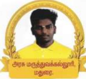
அரசு மருத்துவக்கல்லூரி, மதுரை.