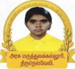
அரசு மருத்துவக்கல்லூரி, திருநெல்வேலி.