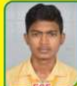
ECE SANJAY S VELLALAR COLLEGE, DINDIGUL