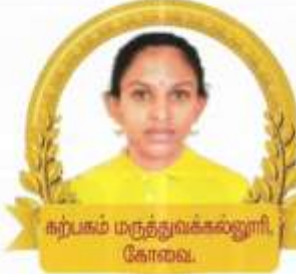
கற்பகம் மருத்துவக்கல்லூரி, கோவை.