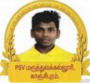
PSV மருத்துவக்கல்லூரி, காஞ்சிபுரம்.