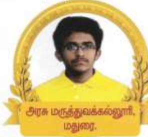
அரசு மருத்துவக்கல்லூரி, மதுரை.