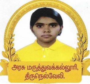
அரசு மருத்துவக்கல்லூரி, திருநெல்வேலி.