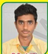
B-Tech(IT) BHAVANBALJI G PAURUAL UNIVERSITY, GUJARAT