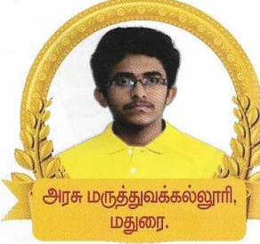
அரசு மருத்துவக்கல்லூரி, மதுரை.