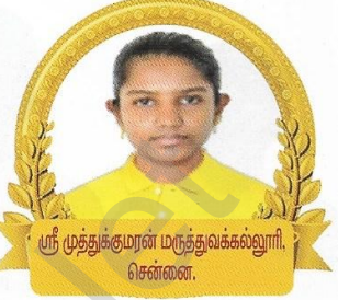
ஸ்ரீ முத்துக்குமரன் மருத்துவக்கல்லூரி, சென்னை.