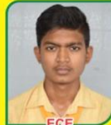
ECE SANJAY S VELLALAR COLLEGE, DINDAL