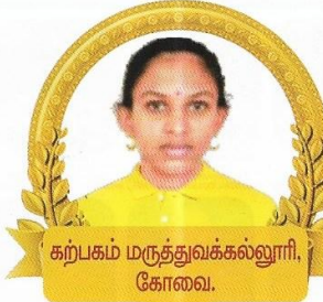
கற்பகம் மருத்துவக்கல்லூரி, கோவை.