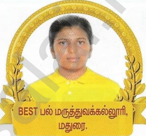
BEST பல் மருத்துவக்கல்லூரி, மதுரை.