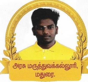
அரசு மருத்துவக்கல்லூரி, மதுரை.