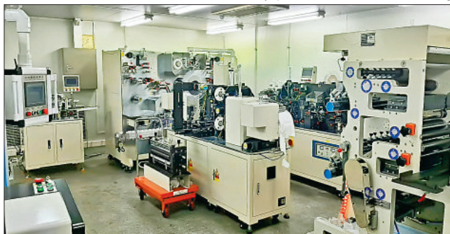
Assembly Line Equipments Inside 1% RH Dry Room for Making 1000 cells/day

The ICeNGESS project and its associated collaborations hold immense promise for India's future. By promoting indigenous battery production, ICeNGESS will contribute to: