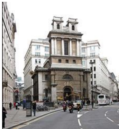
Lombard Street, London

London, is a street notable for its connections with the City of London's merchant, banking and insurance industries,